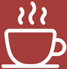
Cup of coffee

Sales tax applies to common items, such as clothing, restaurant meals, toys and non-prescription drugs.